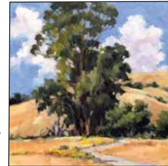
"Toro Park Monarch" 12x12 Honorable Mention