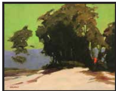
Carmel Dunes by Stan Robbins