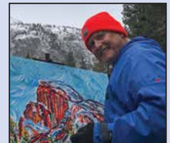
Theodore Heublein In Yosemite