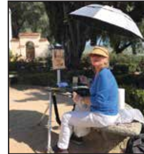
San Juan Bautista Paint-out