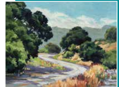
2nd Place Julia Seelos Fog Rolling In