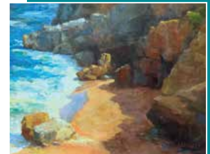
3rd Place Bobbie Braninerd Garapatta Beach