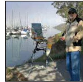
Moss Landing Paint-out