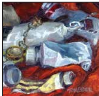
Some of Tamara Keiper's 31 day challenge paintings

MICHELE HAUSMAN will be teaching a six Saturday morning studio painting class beginning in June 2018 .