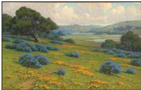
John Marshall Gamble, A Spring Morning, 1915. Oil on canvas, 24 x 40 in.

continues with quieter Barbizon-inspired and Tonalist landscapes in both watercolor and oil. These in turn give way to plein-air Impressionist and Post-Impressionist scenes of mountains, desert, and sea.