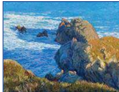
Wayne Adachi "Morning at Rocky Point"