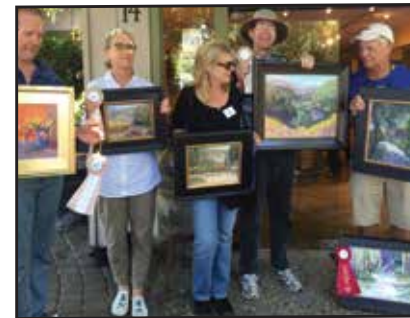
Paint the Village award winners