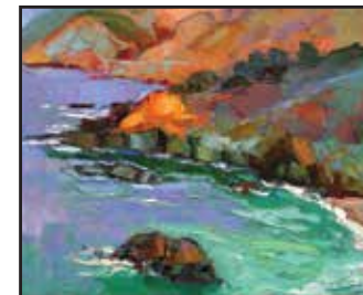
2nd Place Cyndra Bradford "Seven Palms" 14 x 18