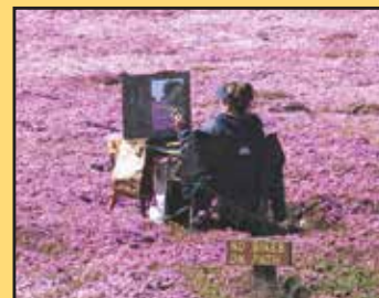
Painting during the festival at PG