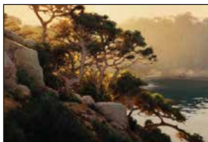
"Summer Light, Point Lobos" Brian Blood, Oil 24"x36"

This exhibit provides an opportunity MBPAPA members to display what they consider their best work and favorite subjects. Any subject and style and medium is acceptable including landscapes, portraits, and still lifes" In keeping with the "plein air" ideals of our organization, paint from "live"