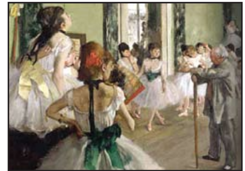
The Dancing Lesson by Edgar Degas (1873-1876)

American expatriate Whistler's Arrangement in Gray and Black , known to many as "Whistler's Mother." Manet, Monet, Renoir, and Sisley are showcased with works dating from the 1860s through 1880s, along with a selection of Degas' paintings that depict images of the ballet, the racetrack, and life in the Belle Époque. Tickets go on sale April 6th. http://orsay.famsf.org/ 415.750.3600