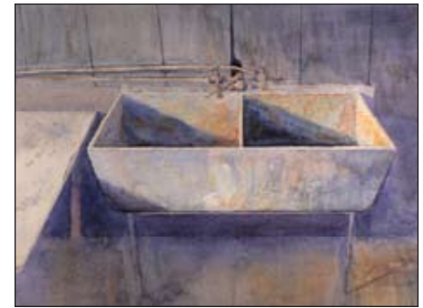
Rolf Lygen, Old Wash Tub, Watercolor on Paper

The WFWS exhibitions have works on paper, including paper collage, casein, gouache, tempera, acrylic and transparent or opaque watercolors. WFWS http://www.wfws.org/