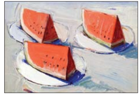
W. Thiebaud, Watermelon Slices 1961 Oil 16 x 22