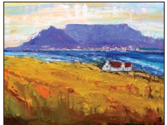
Lilli-anne Price, Table Mountain, 30x40. oil and encaustic