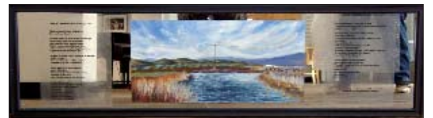
"Lines of Communication at Bridge 122" by Paola Berthoin, Oil mounted on Mirror