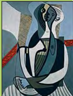
Pablo Picasso, Femme Assise , 1927