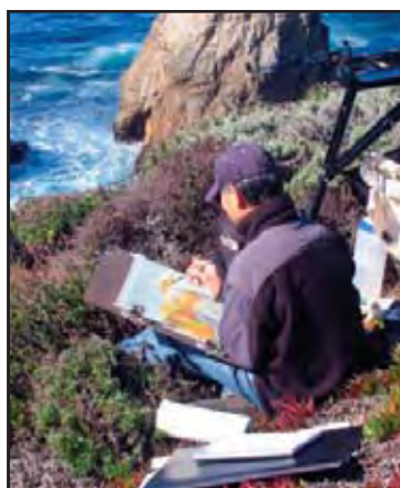
Joe Oyue at Sobrantes Pt.