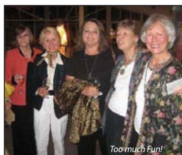
Too much Fun!