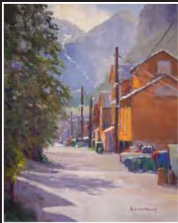
DougMorgan-The Falls Beyond

Now accepting applications for the 2008 Colorado Celebration, must be postmarked by November 30, 2007. http://www.telluridepleinair.org/