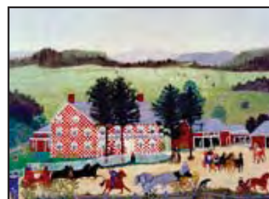
Checked House by Grandma Moses

Anna Mary Robertson (Grandma) Moses' (1860-1961) status as a cultural icon is extraordinary in American art. Raised on an upstate New York farm, she was a traditional daughter, wife, mother, homemaker and grandmother who at age 76 tried painting after arthritis made needlework painful. Her passion for painting came late in life, but she created more than 1,500 paintings before her death at age 101. Distinguished by idyllic rural subjects, Moses' style is immediately recognized; her charming themes illustrate the American ideal of prosperity and happiness rooted in an agrarian society.