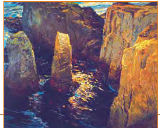
A.Ritschel - Monterey Cove

Monterey Museum of Art , 559 Pacific Street PH: 831.372.5477 info@montereyart.org